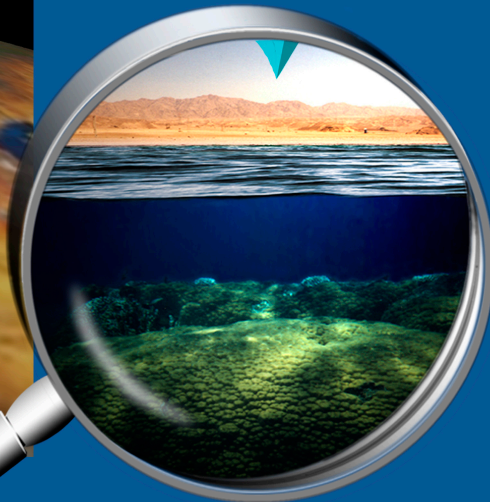
Red Sea coral